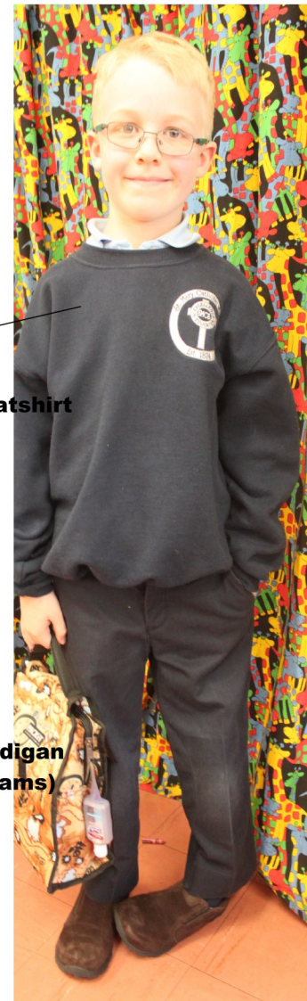
Option: Navy untrimmed cardigan (v- or crewneck - no monograms)