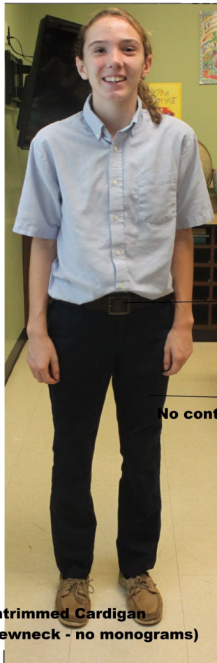
Black or Brown Belt