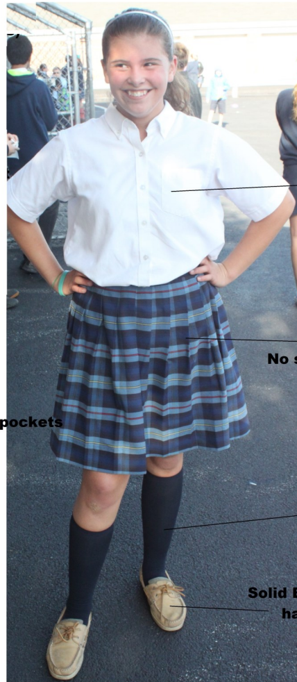
Short or Long Sleeve Powder Blue or White Tailored Oxford Shirt

Option: Navy Untrimmed Cardigan (v- or crewneck - no monograms) OR Navy SMCS Logo Crewneck Sweatshirt