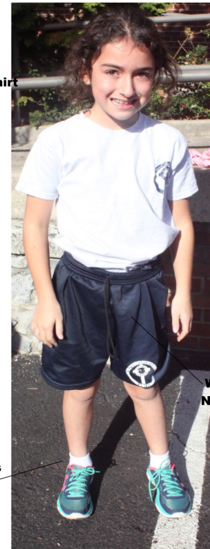
Warm Weather Option Navy Mesh Gym Shorts w/ SMCS logo