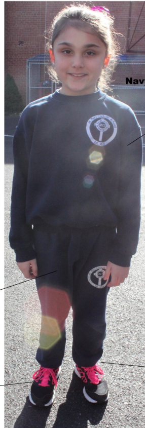
Navy Crewneck Sweatshirt w/ SMCS logo