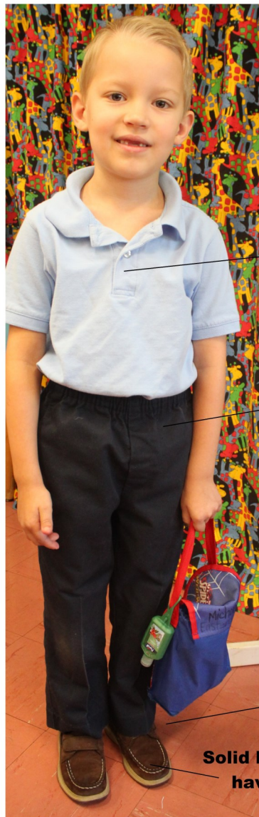
Short or Long Sleeve Powder Blue Polo Shirt