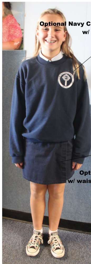
Optional Navy Crewneck Sweatshirt w/ SMCS logo

Each year, dates are determined as Warm Weather Option dates. These typically occur from the first day of school in the Fall through mid-October and in the Spring from mid-April through the end of the school year.