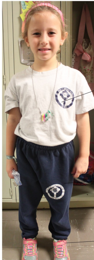
Gray T-shirt w/ SMCS logo