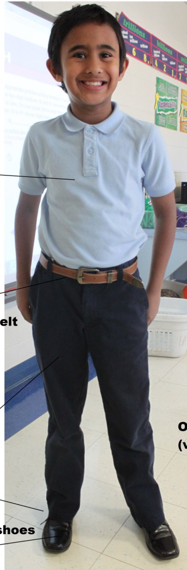
Solid black, brown, or navy dress shoes having a neutral color sole