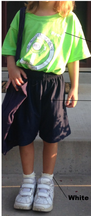
PreK logo T-shirt