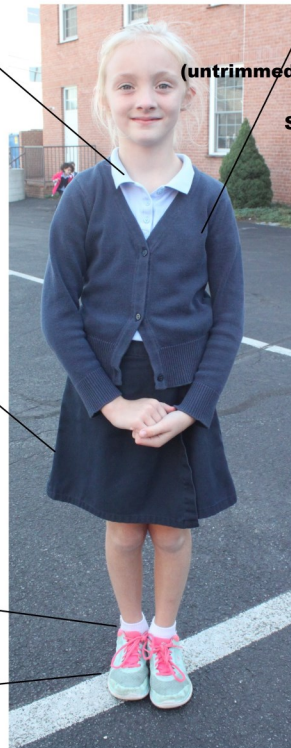
Optional Navy Cardigan (untrimmed v- or crewneck, no monograms) OR SMCS Crewneck Sweatshirt