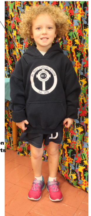
Navy Hoodie Sweatshirt w/ SMCS logo MAY ONLY BE WORN ON GYM DAYS