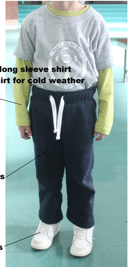
Optional long sleeve shirt under T-shirt for cold weather