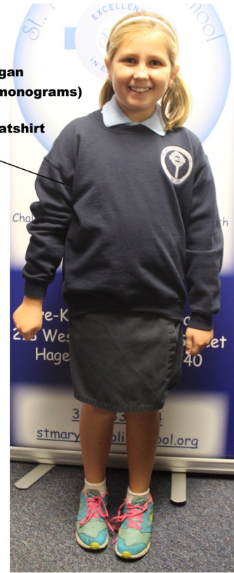
Optional Navy Cardigan (untrimmed v- or crewneck, no monograms) or SMCS crewneck Sweatshirt