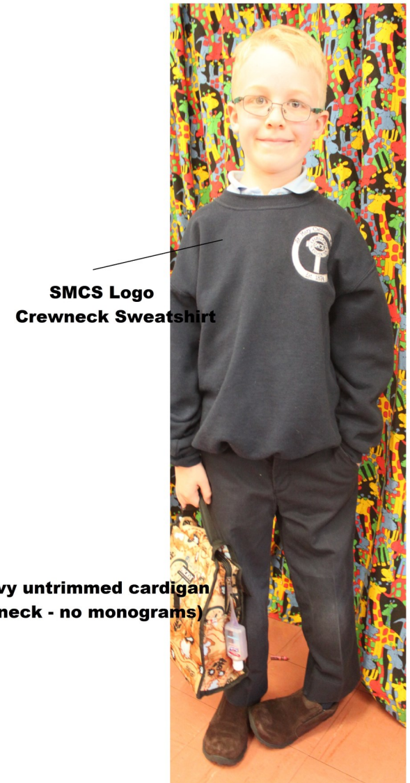
SMCS Logo Crewneck Sweatshirt